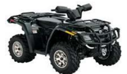
2008 Can-Am Out-lander 400 XT EFI

To obtain raffle tickets contact the ATV/BC office at atvbc@telus.net or phone toll-free 1.866.766.7823